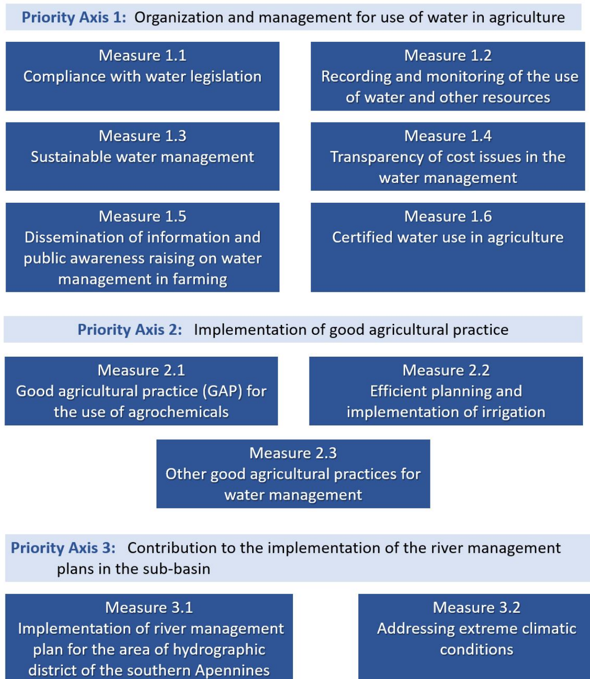
Figure 2. Priority axis of the proposed WMAS

During the first year of AgroClimaWater project, the proposed WMAS and its three Priority Axis (PA) were defined, consisting by several measures and sub measures, as follows: